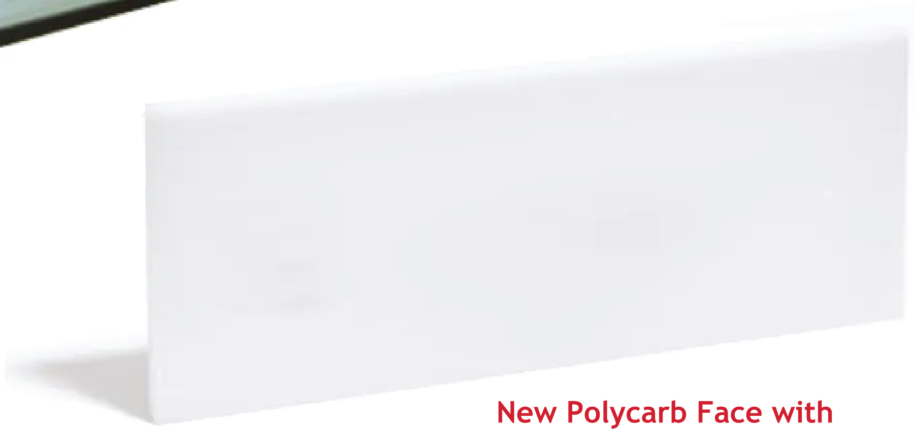
New Polycarb Face with Viny Graphics