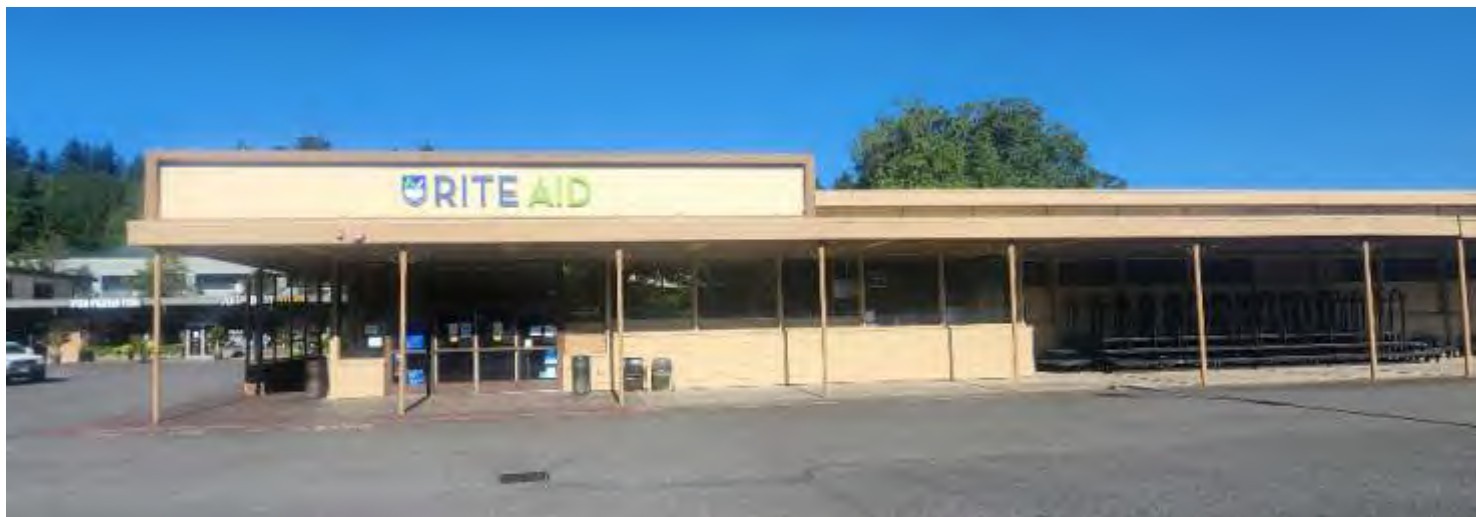
Existing Signage Overview

Drawing Original: 05/22/25 Last Revision Date: 07/10/25 Survey Date: 00/00/00 Install Completion Date: 00/00/00