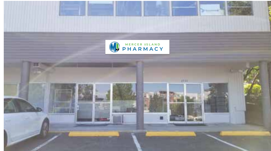
PROPOSED LINEAL FT: 35 ft