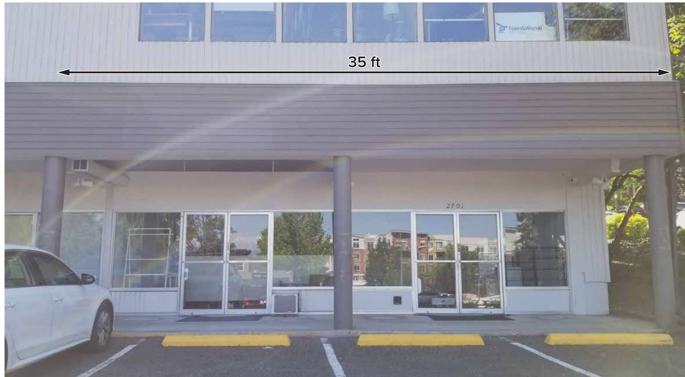
FRONT VIEW LINEAL FT: 35 ft