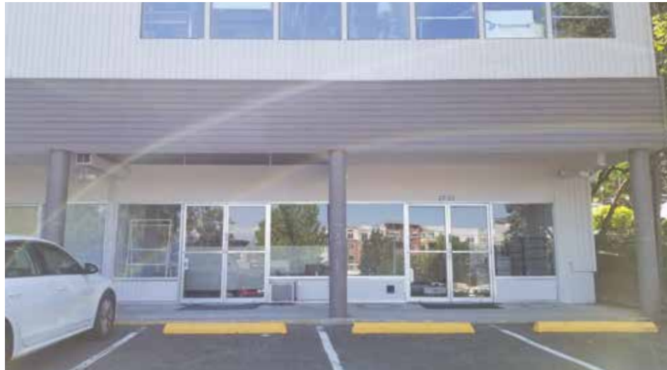
EXISTING LINEAL FT: 35 ft