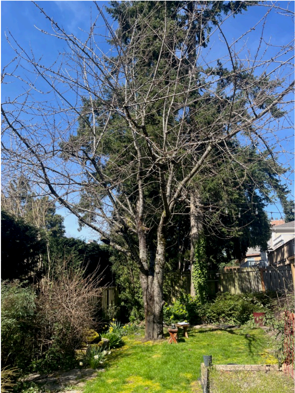
Looking north at the Exceptional Cherry 2478