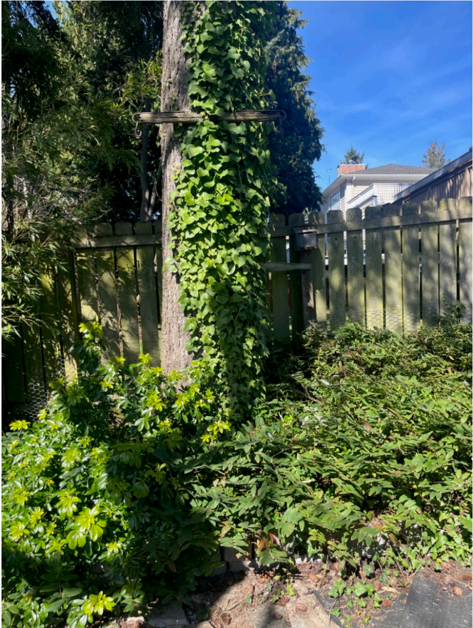
Looking north at the trunk of 2477