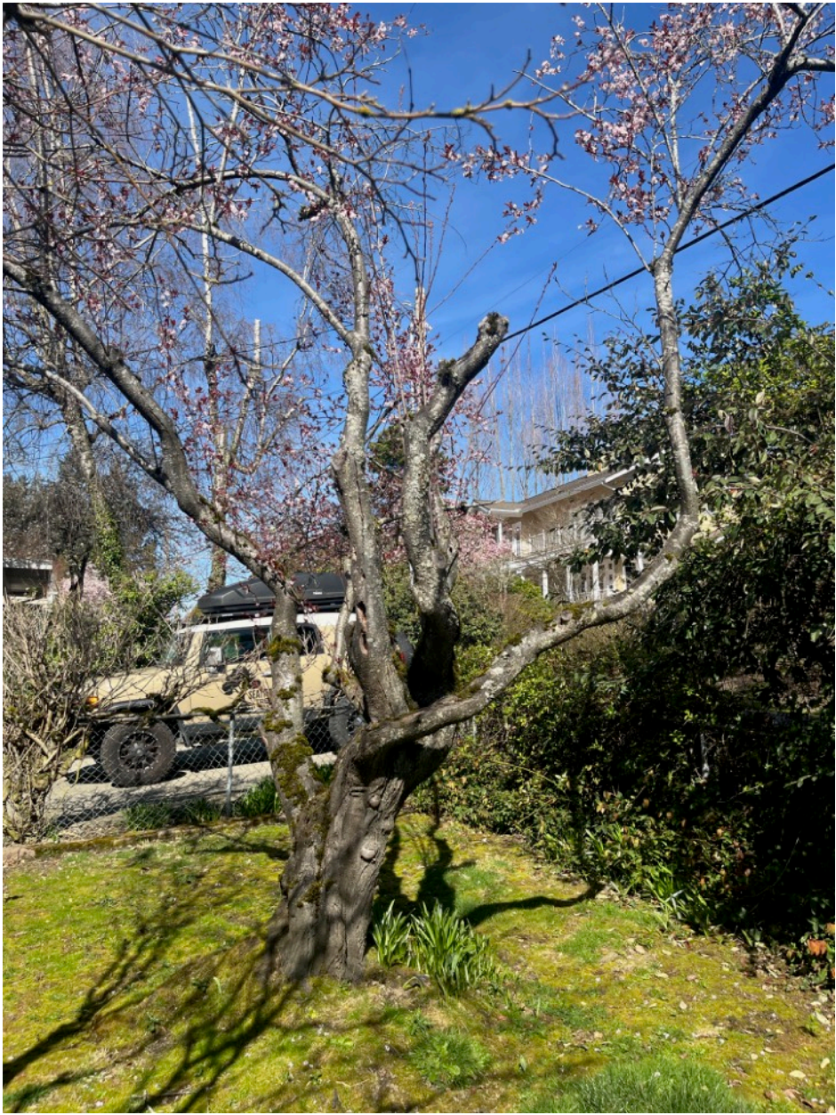
Looking west at 2476