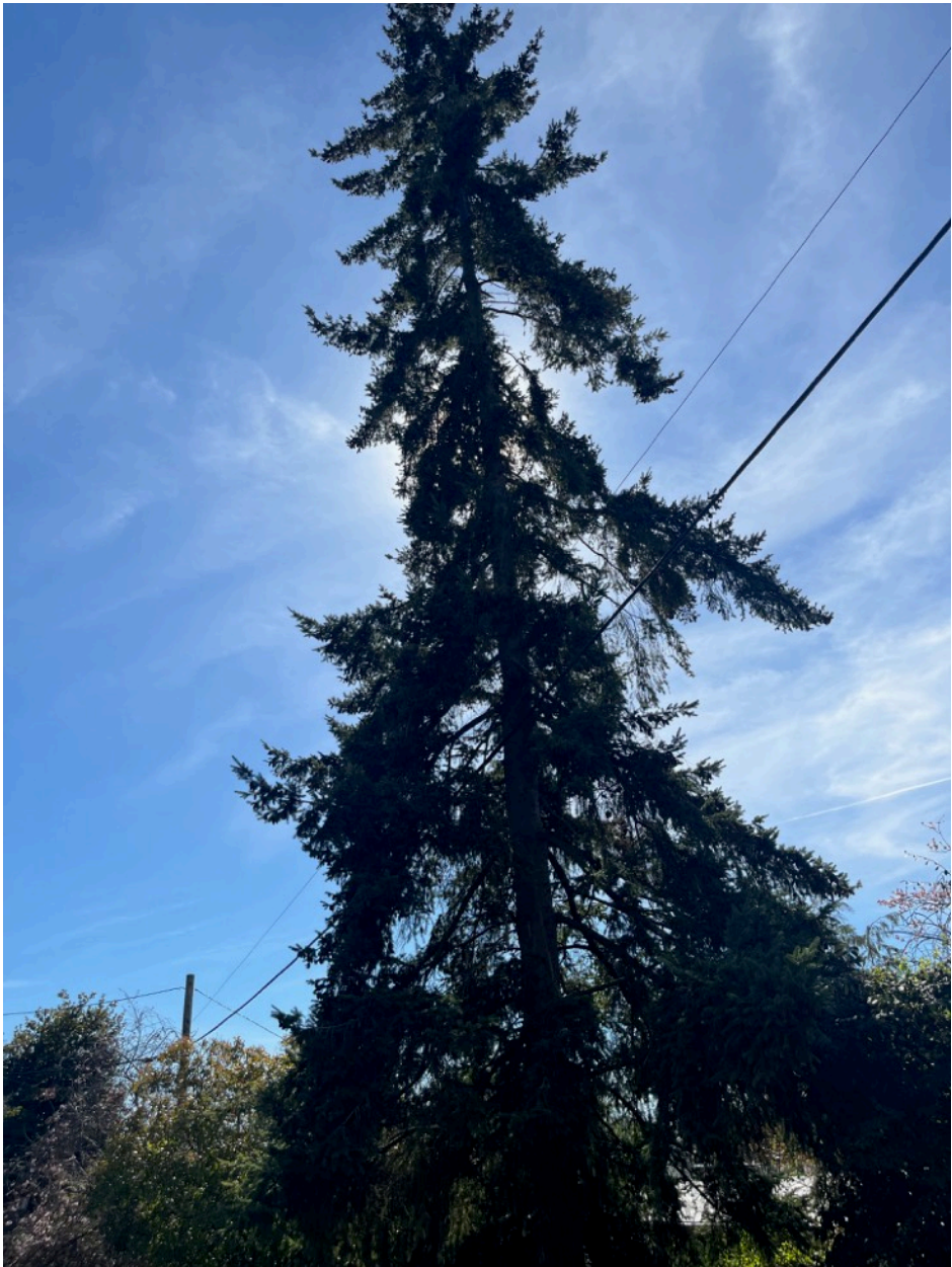
Looking south at 2479