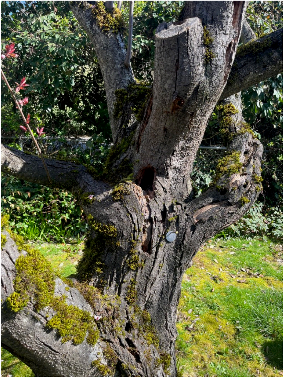
Looking north at the decaying 2476