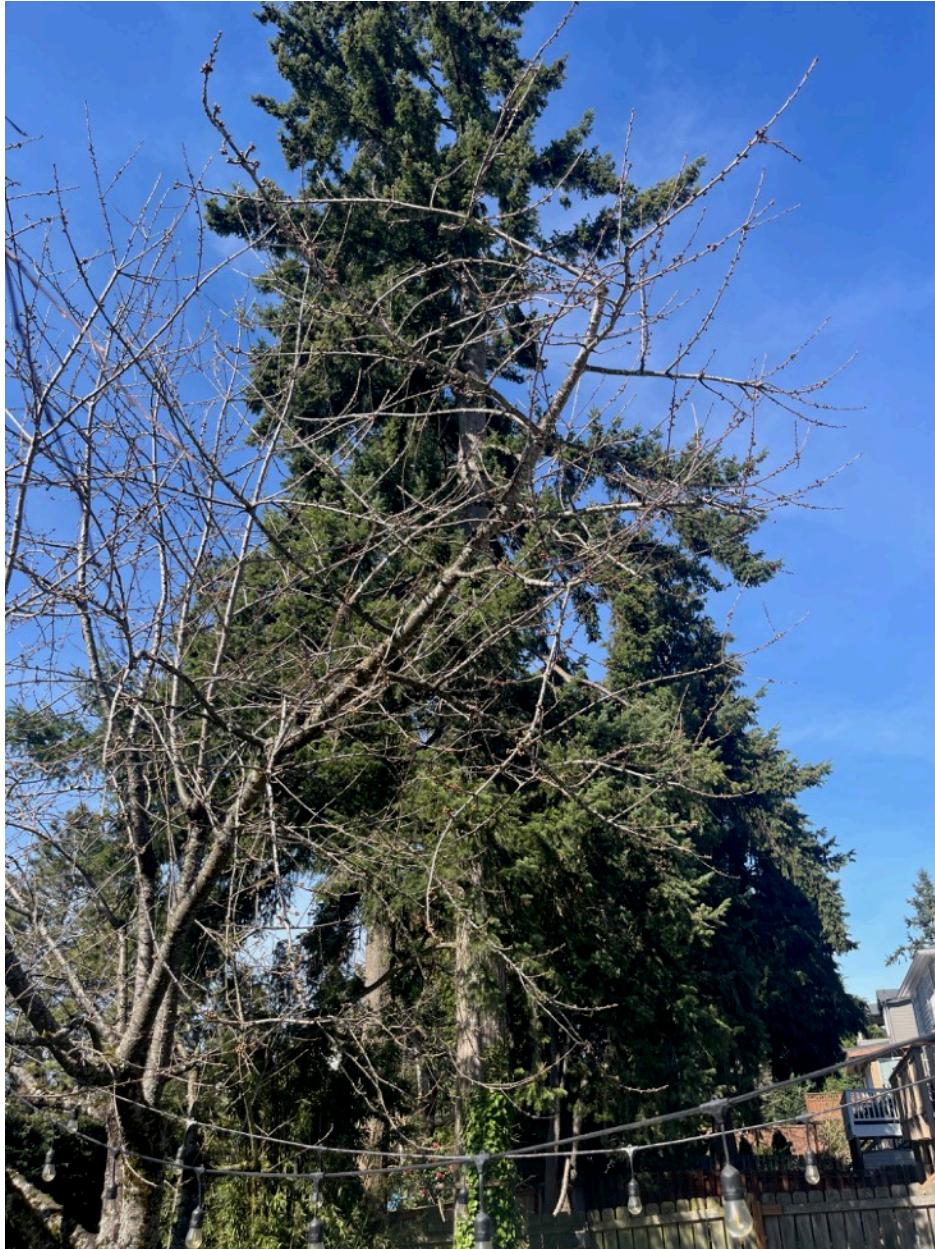
Looking north at 2477 (fir in the background)