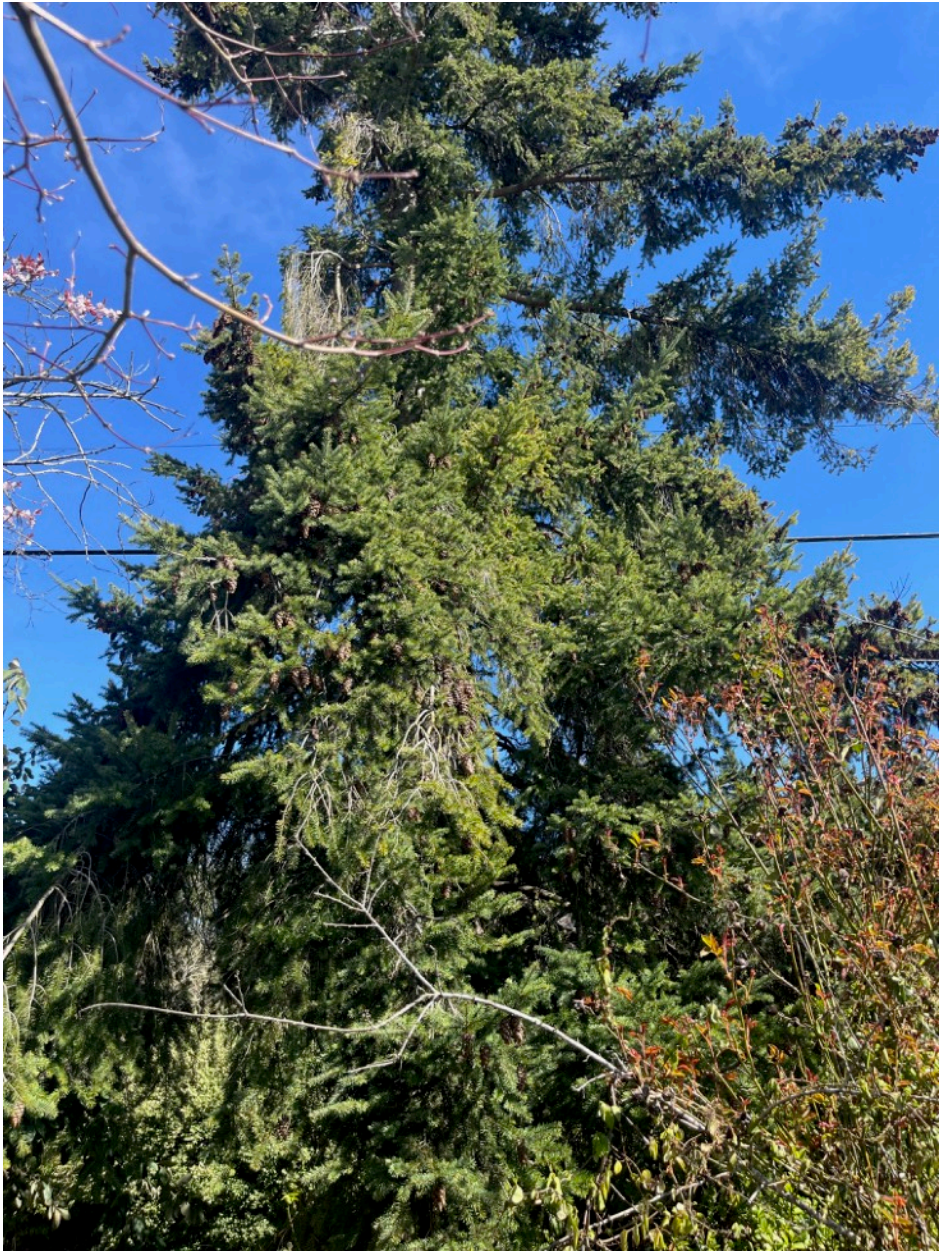
Looking east at the low canopy of 2479