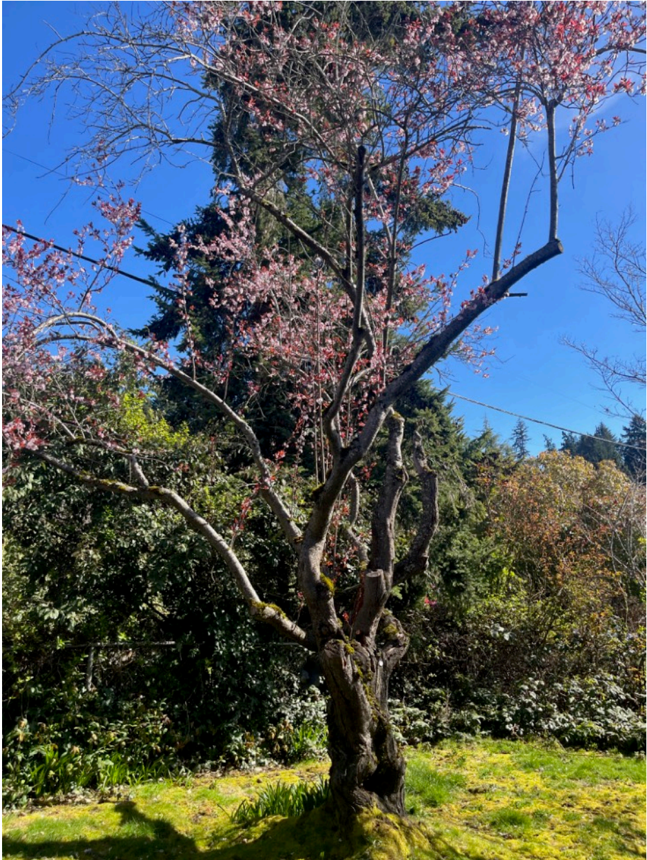
2476 Looking East