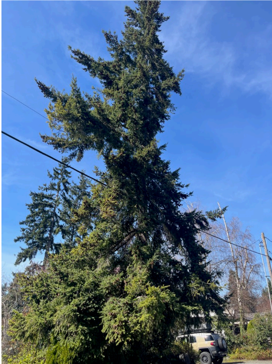
Looking north at 2479 with the power lines running along the east side of the tree